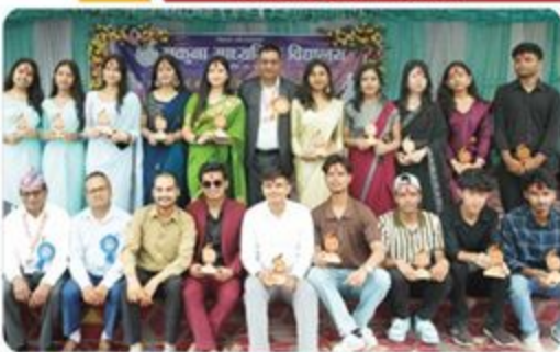
Grade-12 Students in farewell