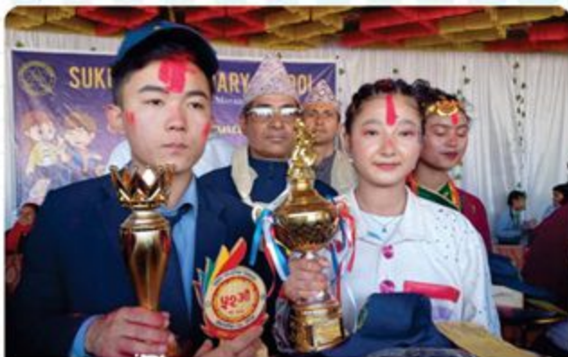
Sukuna IDOL Winners, (Season-1)