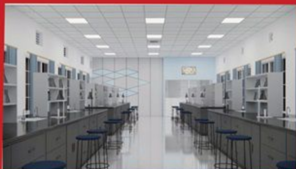
Proposed Chemistry Lab