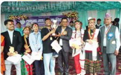
Dancing Idol finalists