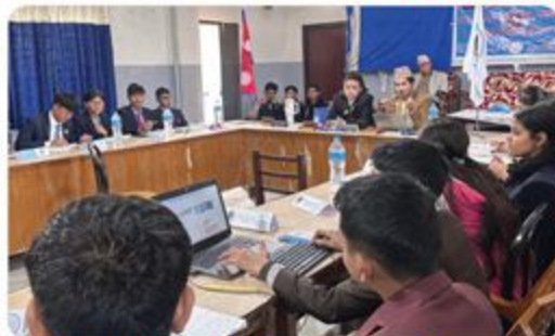
Model United Nations