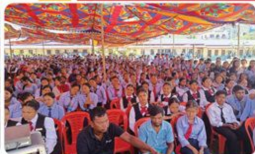
Parents day Gathering