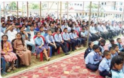
Farewell Program Gathering