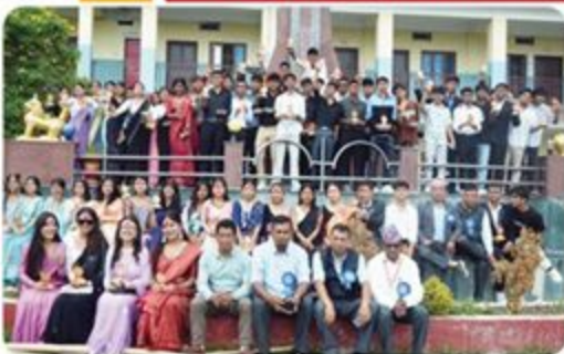
Grade-12 Students in farewell