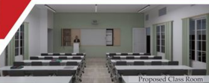
Proposed Class Room