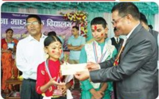
Junior Dancing idol-2081