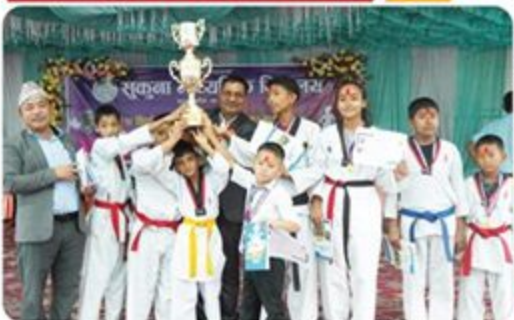
Taekwondo Gold medalists