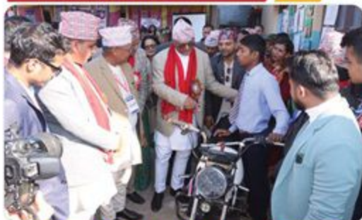
Chief minister's Visit to Exhibition