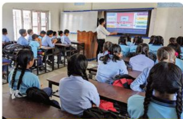
Class Room with Smart Board

LMS अन्तर्गत Teacher's Co-pilot सिकाई कार्यक्रम