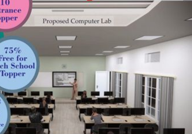
Proposed Computer Lab

विज्ञान विषय (भौतिक, रसायन, जीव) प्रवर्द्धनका लागि विद्यालय विकास योजना निर्माण तथा विद्यालय भौतिक सर्वेक्षण, नक्साङ्कन सम्बन्धी सहजीकरण कार्यशाला २०८० चैत २९ विराटनगर, मोरङ्ग.