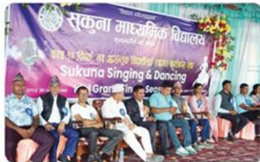
Singing and Dancing Idol-2081