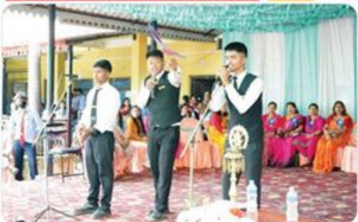
Singers in a program