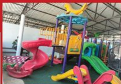
(Montessori Play station)